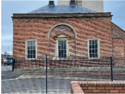
Grade One Listed Building