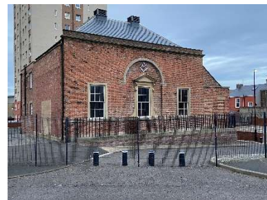
A Historic Landmark in Hendon

It is hoped that the new song created by Sunderland Male Voice Choir will provide a musical legacy about this important landmark in the heartland of Sunderland - Hendon.